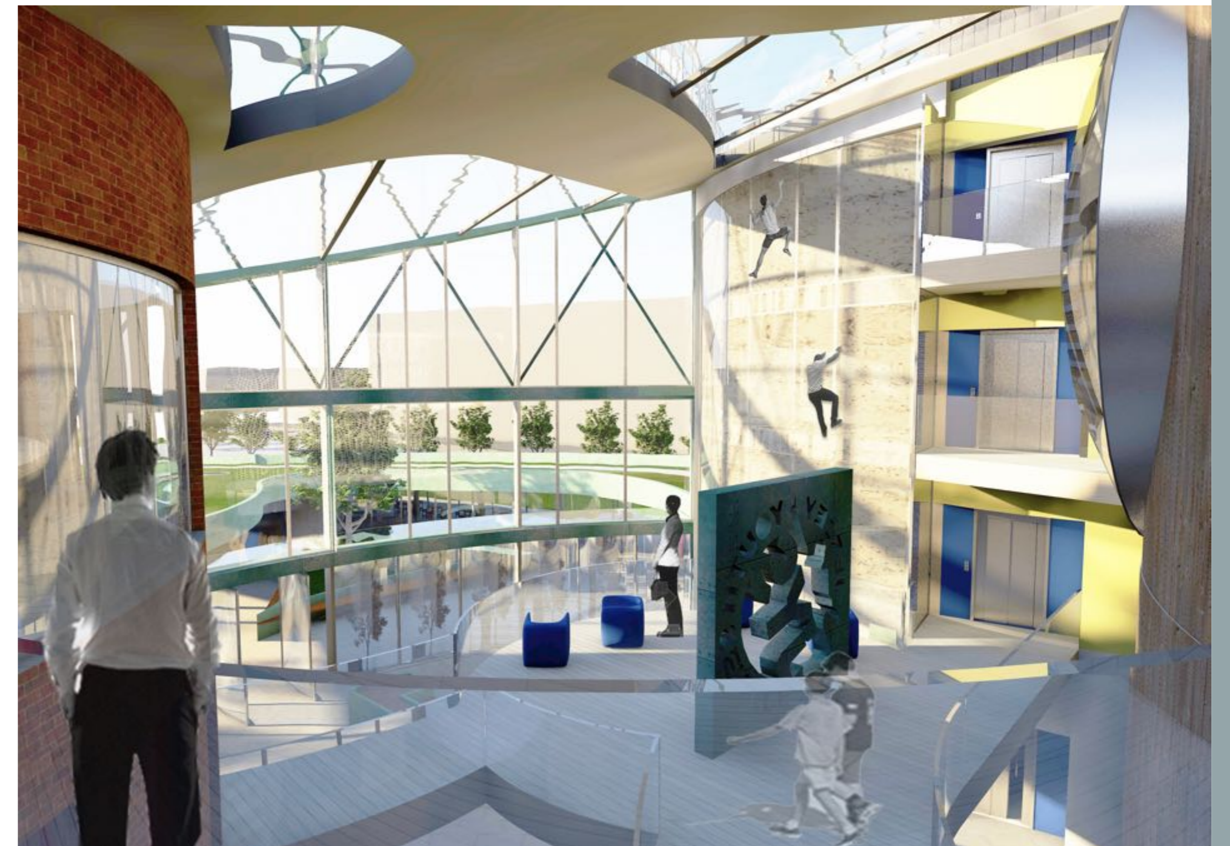
3D perspective Of Atrium