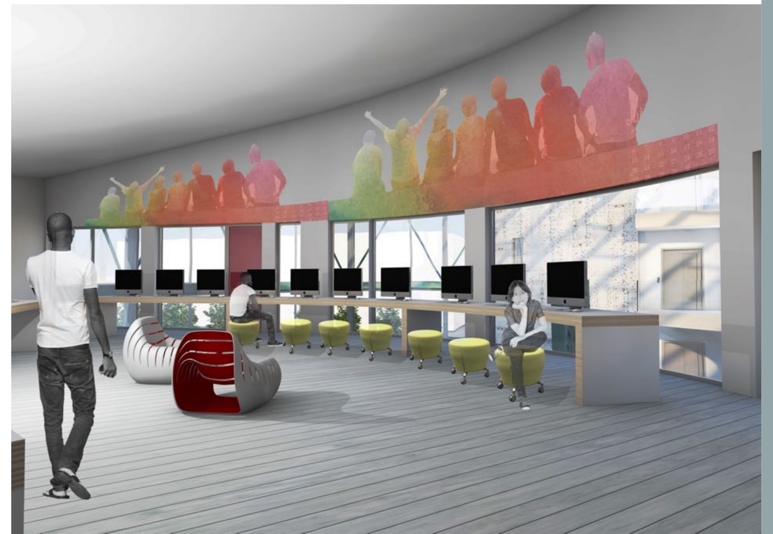
3D perspective second floor IT Suite