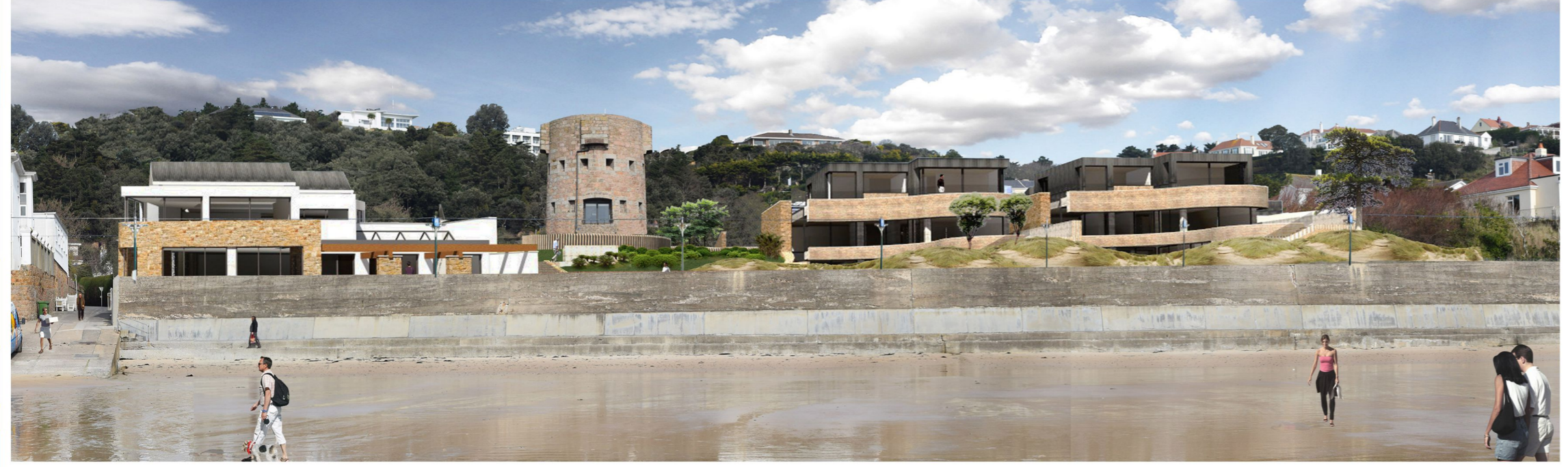
Proposed 3D Visual of South Elevation