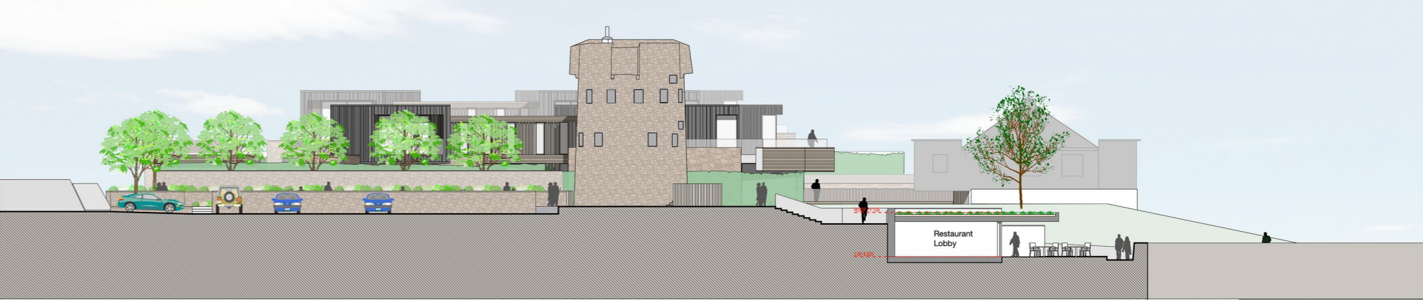
Proposed Site Section Through Public Space