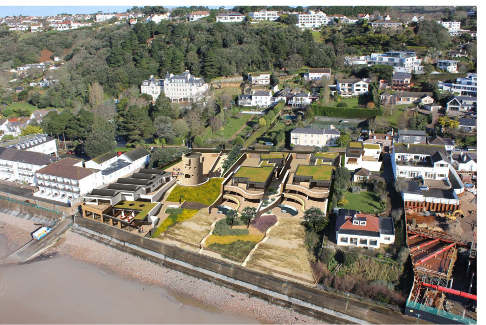
Proposed Aerial 3D Visualization