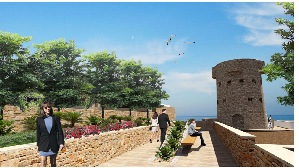
Proposed Public Footpath