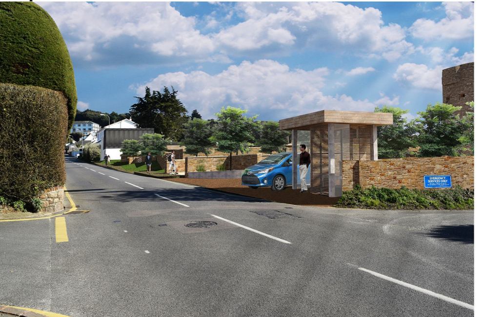
Proposed View From Mont Sohier