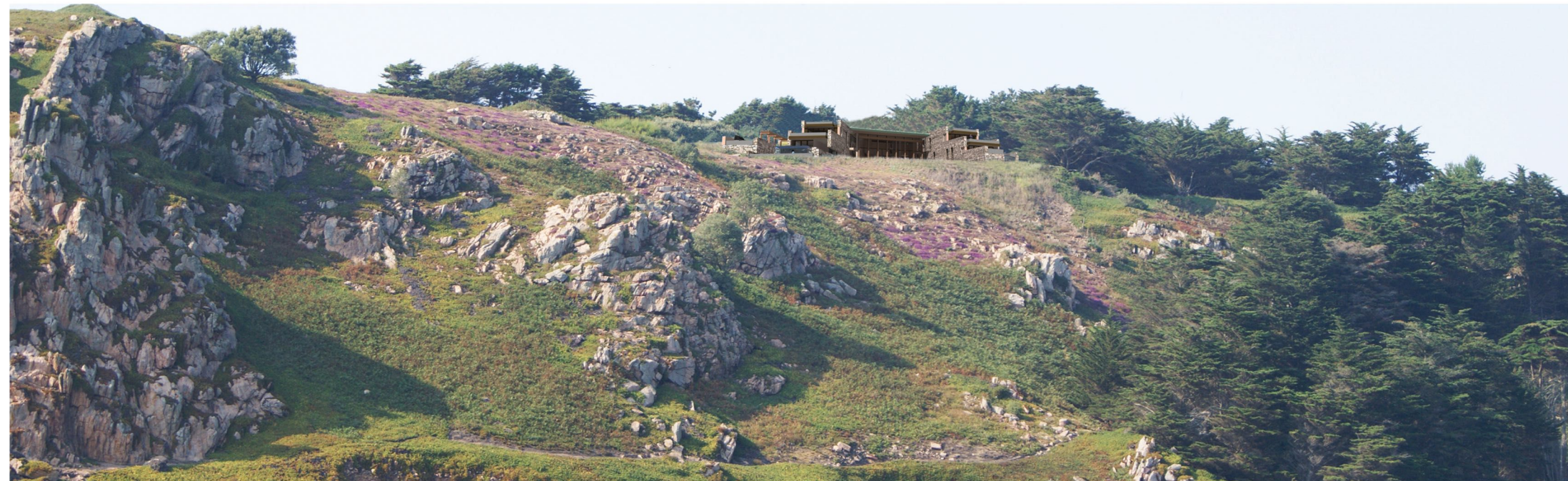
Proposed 3D Visualization of Southern View Showing Site Context

The site occupies a spectacular elevated position on the south coast of the island and enjoys excellent views along the coast