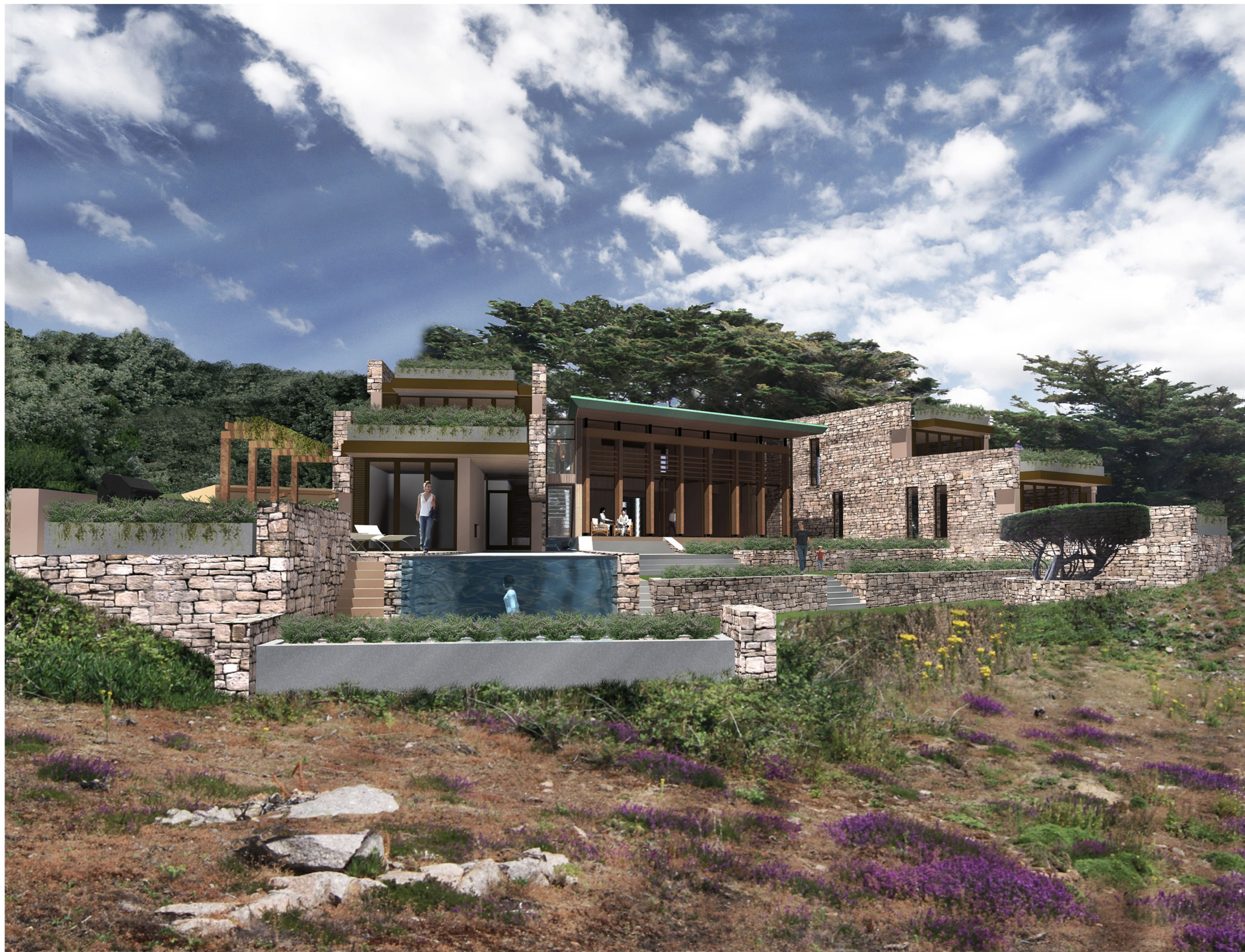
Proposed 3D Visualization of Southern View

The site occupies a spectacular elevated position on the south coast of the island and enjoys excellent views along the coast