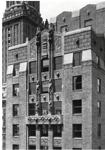
Restoration of Exterior Ornamentation