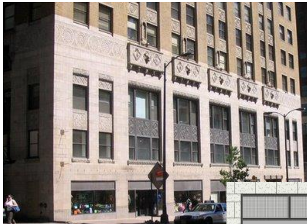
Replacement of All Existing Storefronts