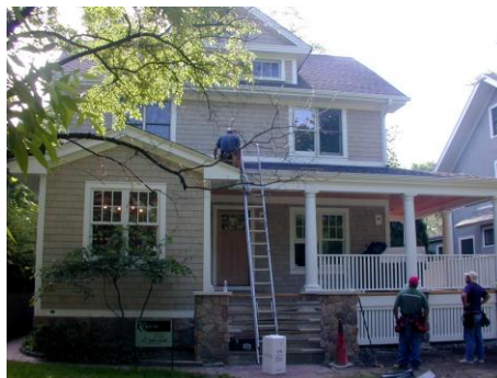
Front Façade – Post Construction