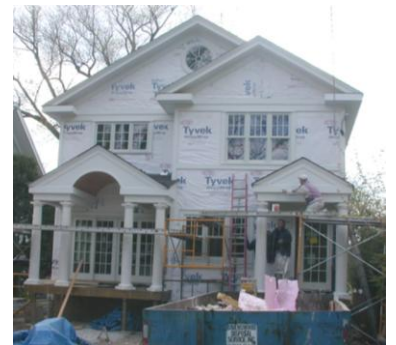
Rear Façade – During Construction