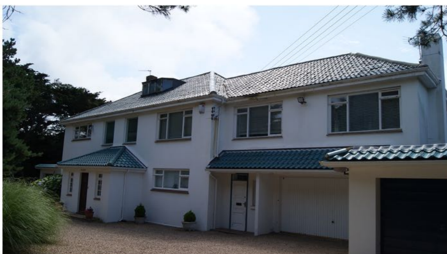
Existing Photograph of Northern Elevation

The application proposed replacing the existing prominent dwelling with a contemporary flat roofed composition that would be less conspicuous, being over a metre lower in height, recessive in plan and its dry stone walls would sit naturally in the cliff top setting. The scheme was refused by committee, approved on appeal but the refusal was finally upheld on grounds of being too large in internal floor area due to the increase of 30 percent of floor area.