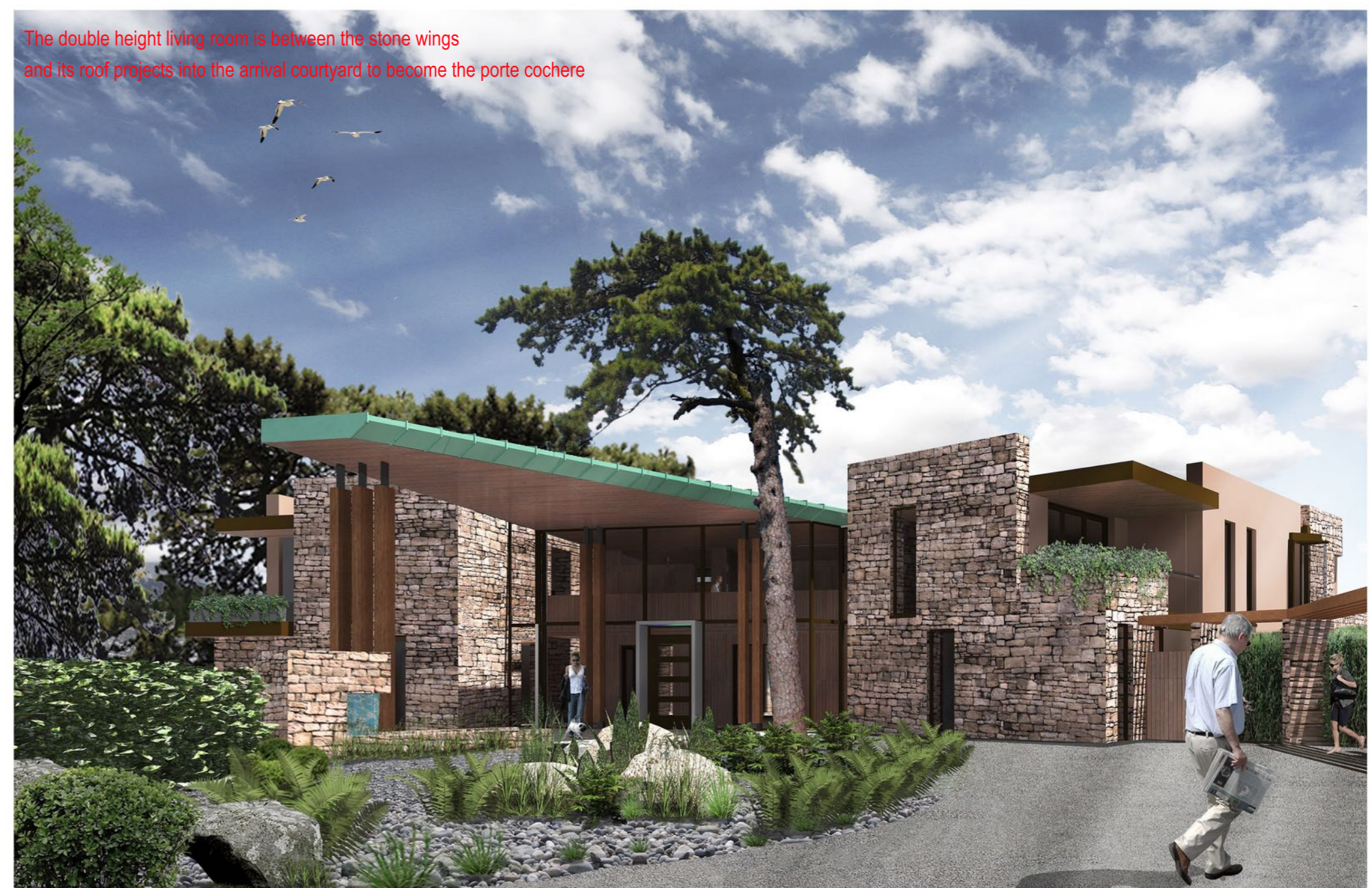
Proposed 3D Visualization of Northern View