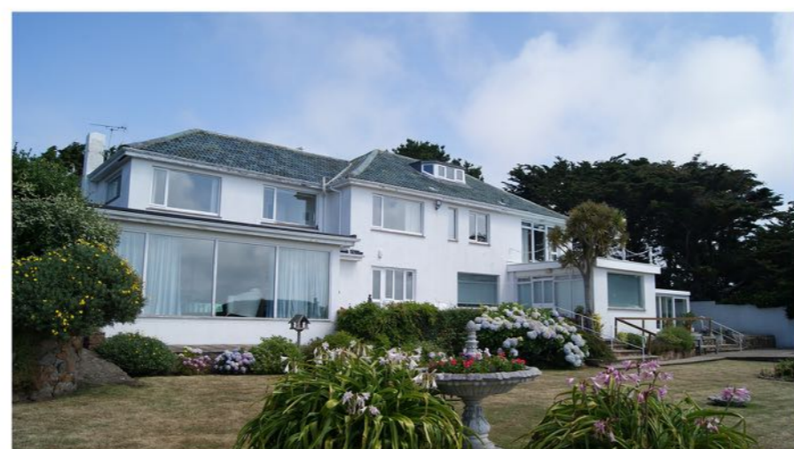
Existing Photograph of Southern Elevation