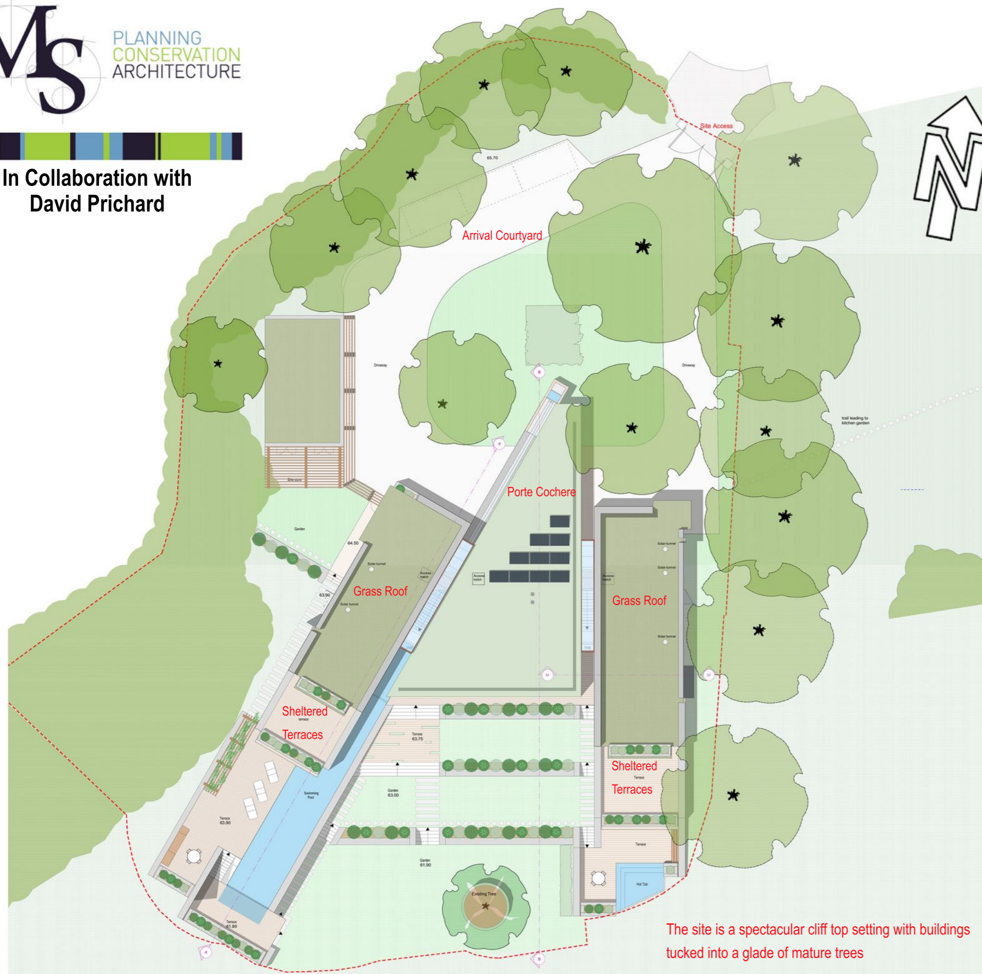
Proposed Site Plan

The application proposed replacing the existing prominent dwelling with a contemporary flat roofed composition that would be less conspicuous, being over a metre lower in height, recessive in plan and its dry stone walls would sit naturally in the cliff top setting. The scheme was refused by committee, approved on appeal but the refusal was finally upheld on grounds of being too large in internal floor area due to the increase of 30 percent of floor area.