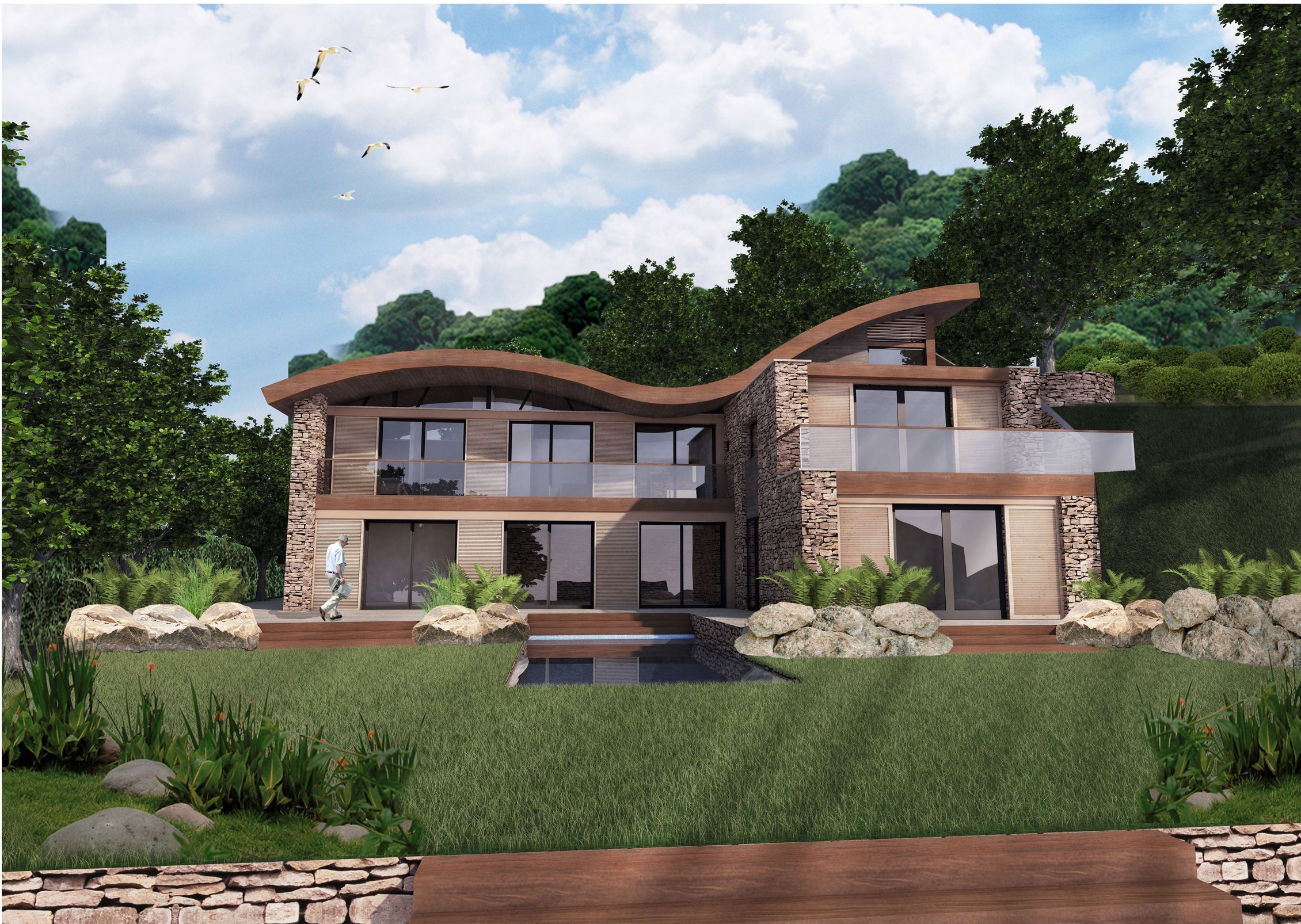
Proposed 3D Visualization of Western View

The walls are finished with dry stone granite which are designed to be continued through certain parts of the interior. The roof is made up of a glulam structure finished in sedum to create the flowing, bespoke, roof design. The south side of the dwelling is built into the existing raised bank with the main staircase creating an internal connection from the entrance lobby up to the raised woodland paths, ensuring the proposed dwelling interacts with its natural site on each floor of the dwelling.