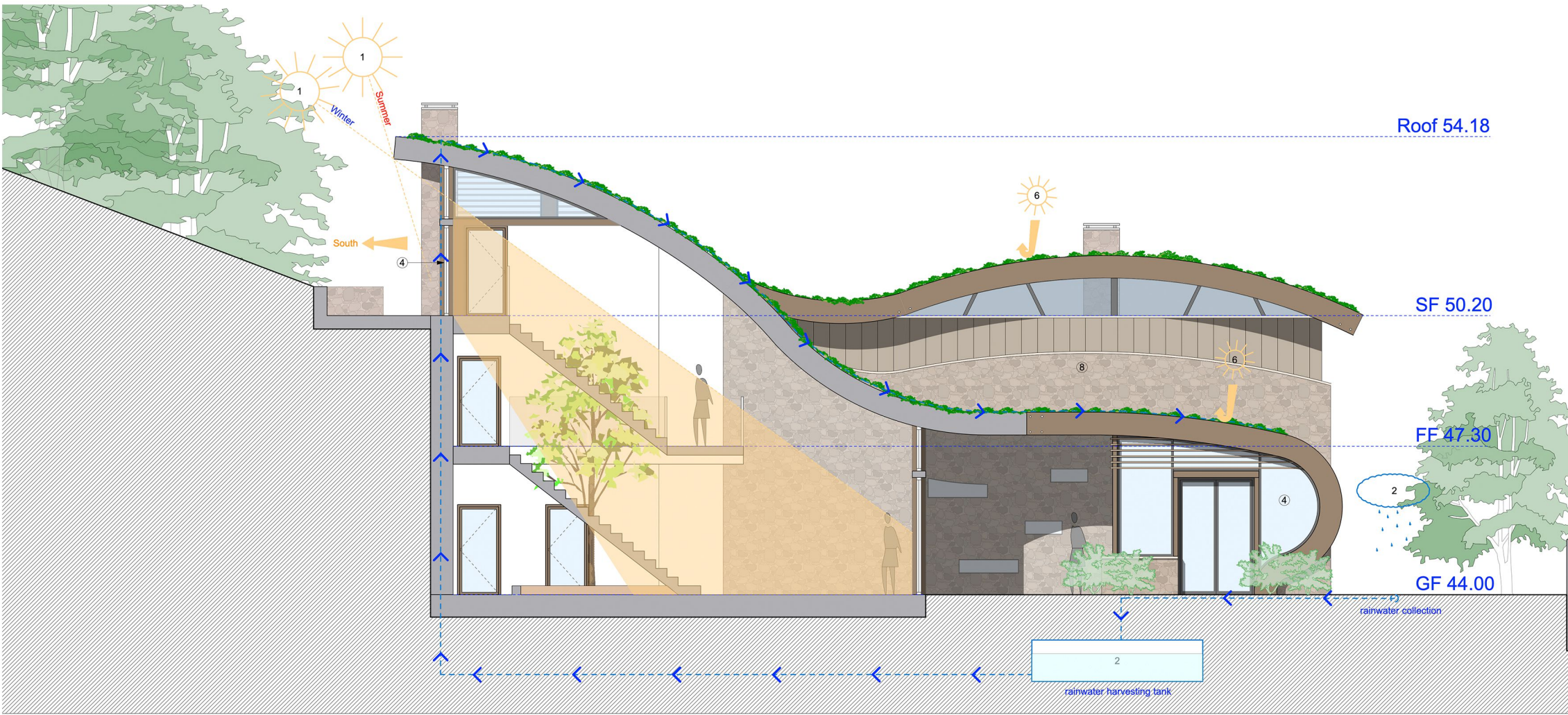
Proposed Section of Entrance Lobby

The walls are finished with dry stone granite which are designed to be continued through certain parts of the interior. The roof is made up of a glulam structure finished in sedum to create the flowing, bespoke, roof design. The south side of the dwelling is built into the existing raised bank with the main staircase creating an internal connection from the entrance lobby up to the raised woodland paths, ensuring the proposed dwelling interacts with its natural site on each floor of the dwelling.