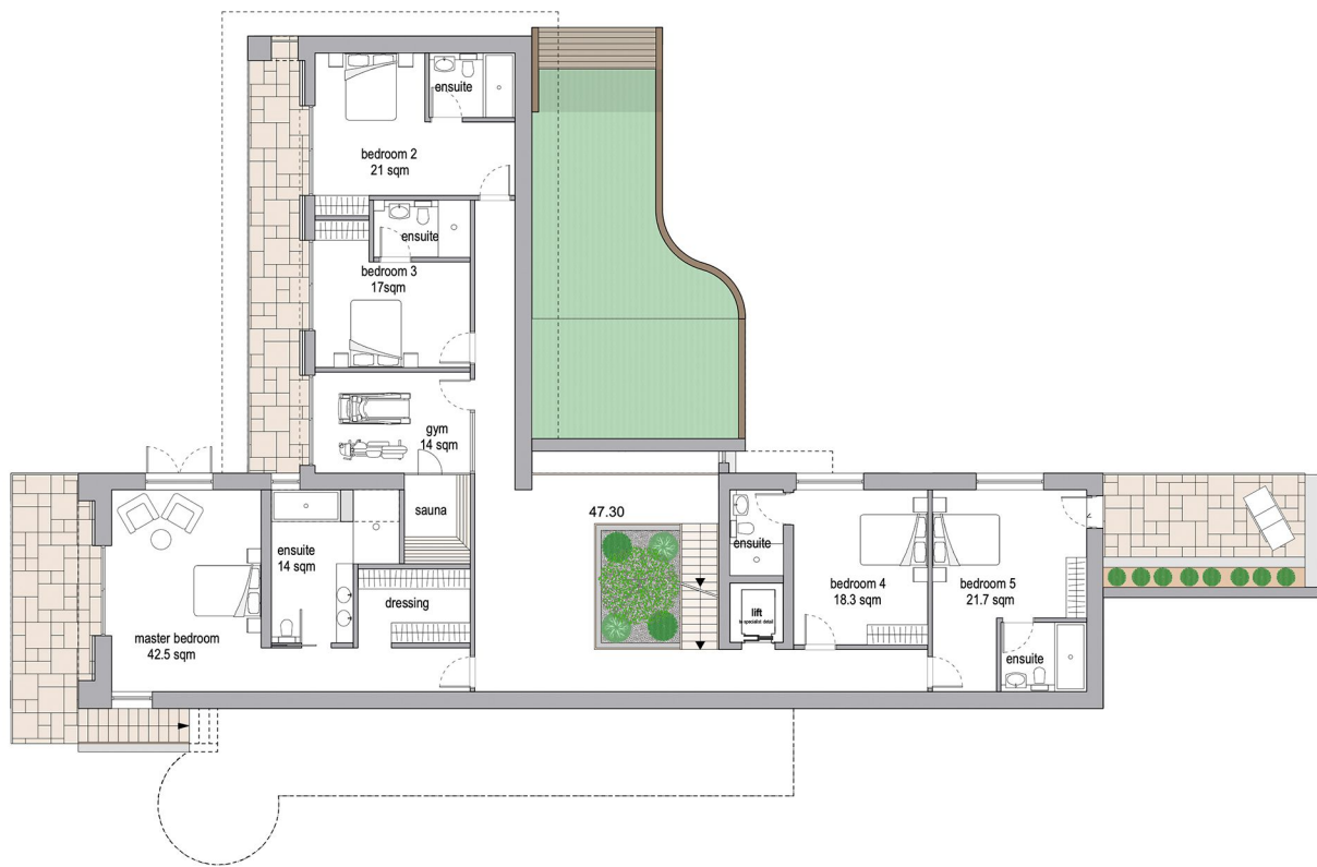
Proposed First Floor Plan