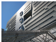
Protruding Surfaces (Federal Building, Morphosis)