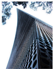
Copper Mesh (De Young Museum)