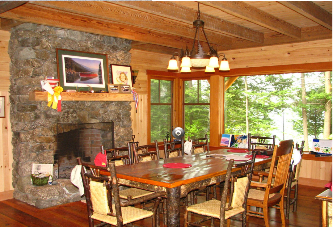
VIEW OF DINING ROOM

cottages were supplanted by McMansions in the style of traditional suburban homes. The Herrington's were eager to bring the flavor of the past back by using indigenous materials both inside and out. The finished home is nestled between the thriving birches, maples and oak trees that dominate the site. From the lake, the home is barely visible and provides a quiet and private retreat for the family throughout the year.