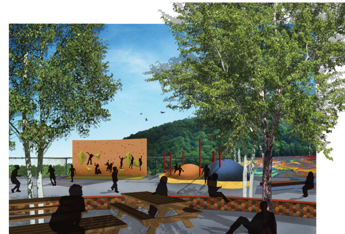
active balance and climb and zone perspective