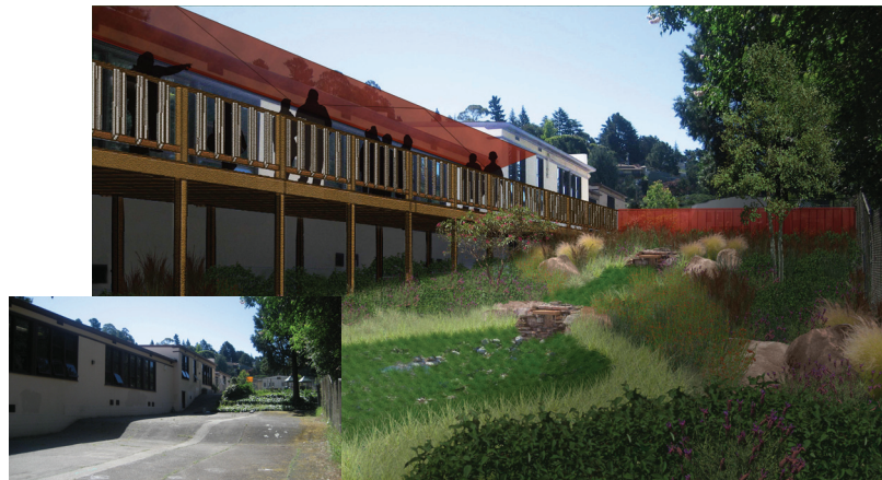
bioswale zone perspective