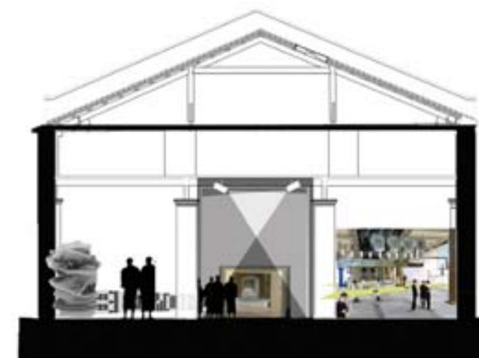
Section diagram of the arsenal:

The center hallway of the arsenal is lined completely with screening material and the other physical installations occur in the flanking spaces.