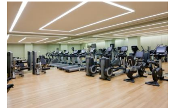
Public Spaces of Building