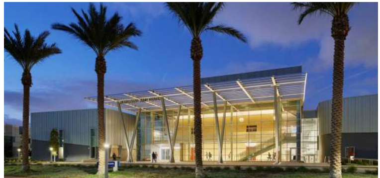
CERRITOS COLLEGE PERFORMING ARTS CENTER