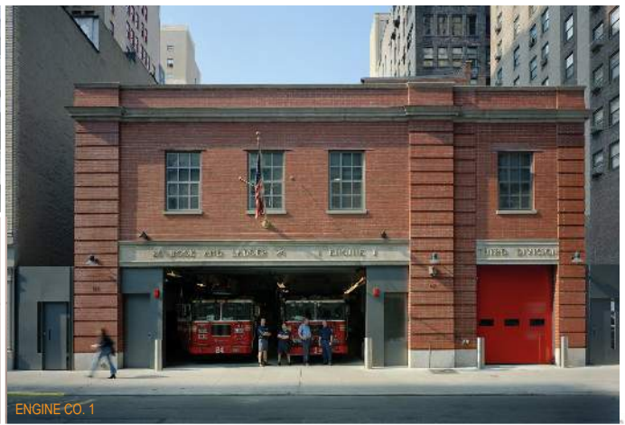
ENGINE CO. 1