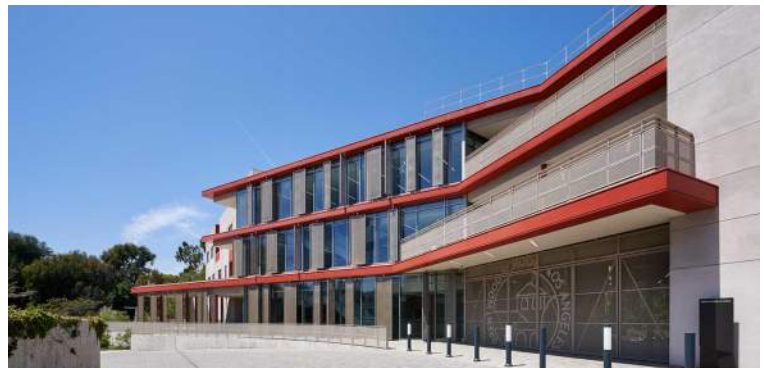
BRENTWOOD MIDDLE SCHOOL LOS ANGELES