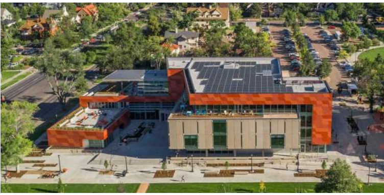
TUTT LIBRARY, COLORADO COLLEGE