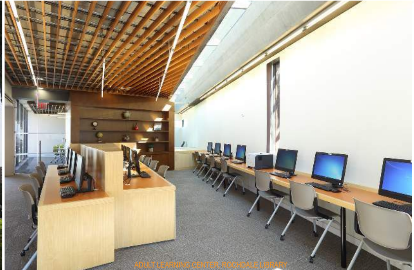
ADULT LEARNING CENTER, ROCHDALE LIBRARY