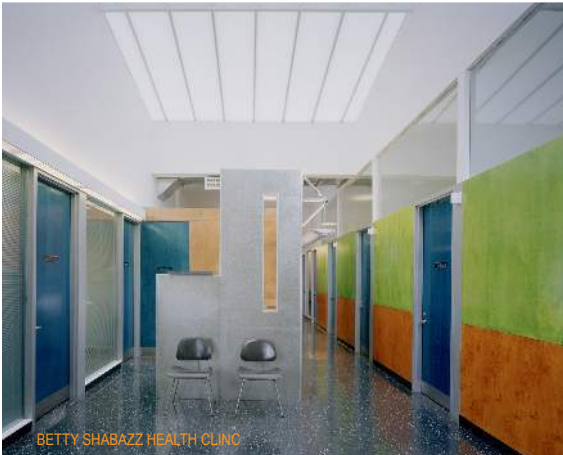
BETTY SHABAZZ HEALTH CLINIC