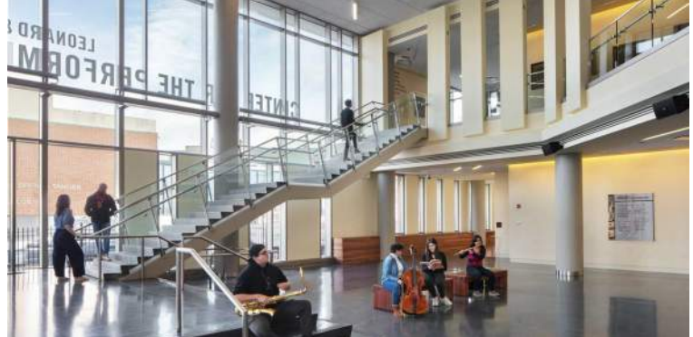
BROOKLYN COLLEGE PERFORMING ARTS CENTER