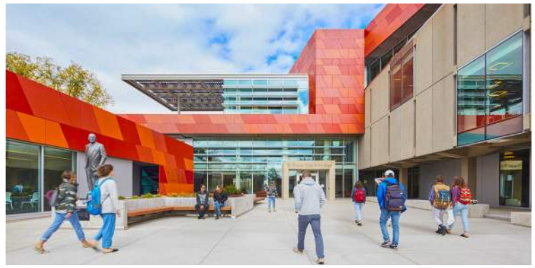
TUTT LIBRARY, COLORADO COLLEGE