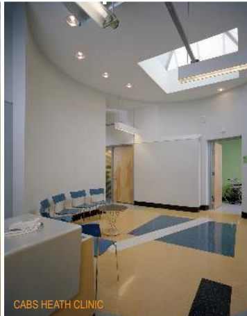
CABS HEALTH CLINIC