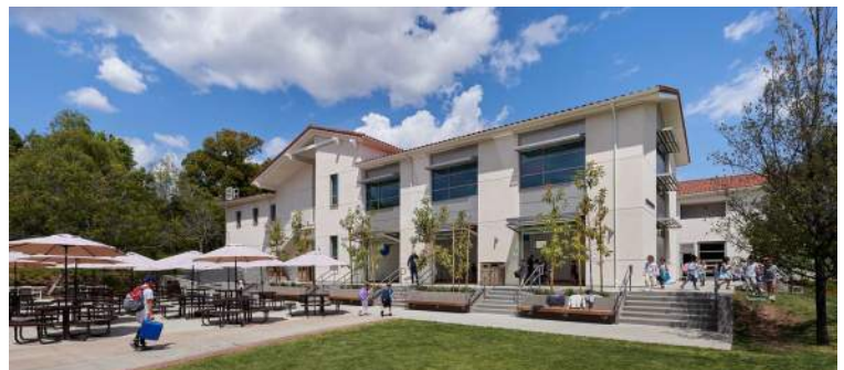
BRENTWOOD LOWER SCHOOL LOS ANGELES