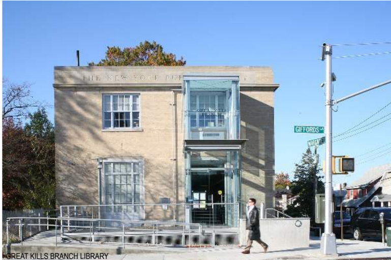
GREAT KILLS BRANCH LIBRARY