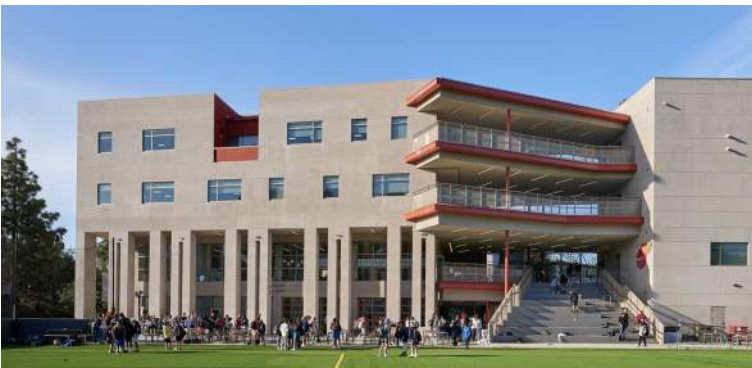
BRENTWOOD MIDDLE SCHOOL LOS ANGELES