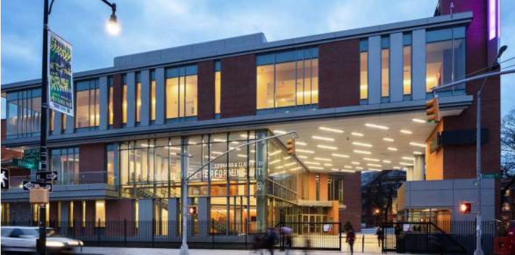
BROOKLYN COLLEGE PERFORMING ARTS CENTER