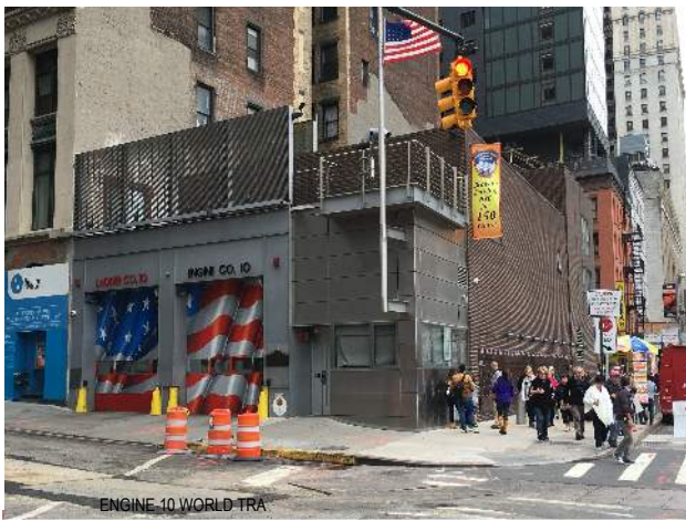
ENGINE 10 WORLD TRADE CENTER