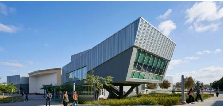
CERRITOS COLLEGE PERFORMING ARTS CENTER