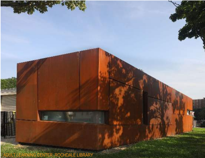
ADULT LEARNING CENTER, ROCHDALE LIBRARY