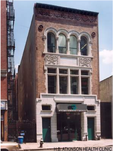
H.B. ATKINSON HEALTH CLINIC