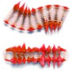
Iteration 1 ^