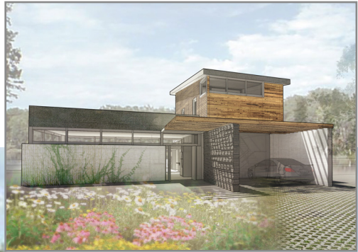
“Best in Class Modern” 2011 Free Green “Who’s Next?” Sustainable Housing Design Competition